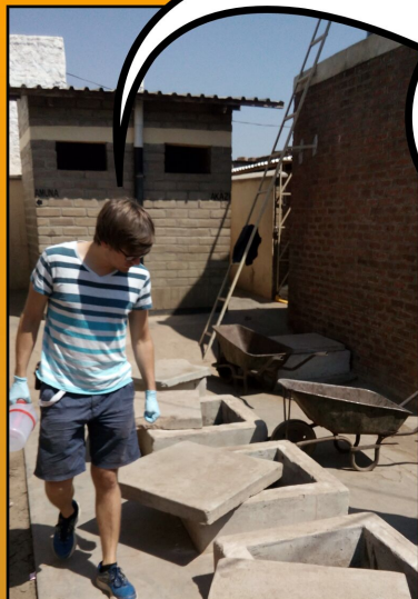
MANGOICH MARKET ABR WAS CONSTRUCTED BY WASTE

WOW! THIS REACTOR TREATS THE FAECAL SLUDGE OF 500 PEOPLE